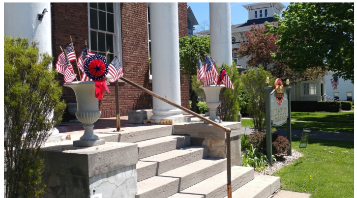
Memorial Day 2020