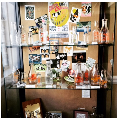
Cow to Consumer Exhibit