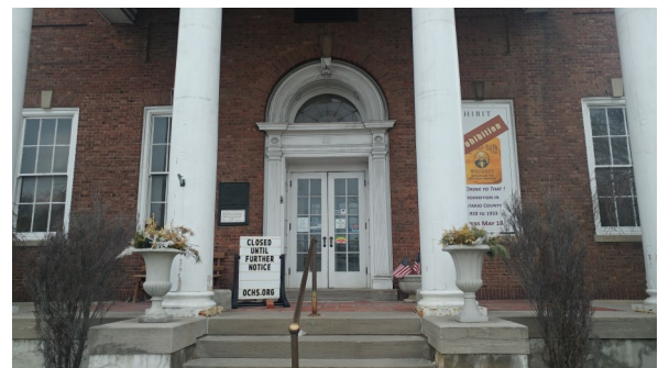
Closed until further notice :~((