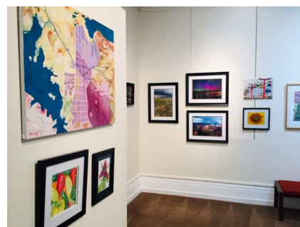
New OCAC Exhibit: "Colors of Our World"