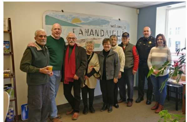
Participants of the FLCC-sponsored Community Podcast