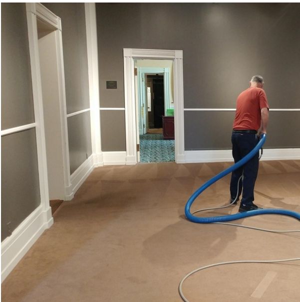
Deep cleaning of the museum